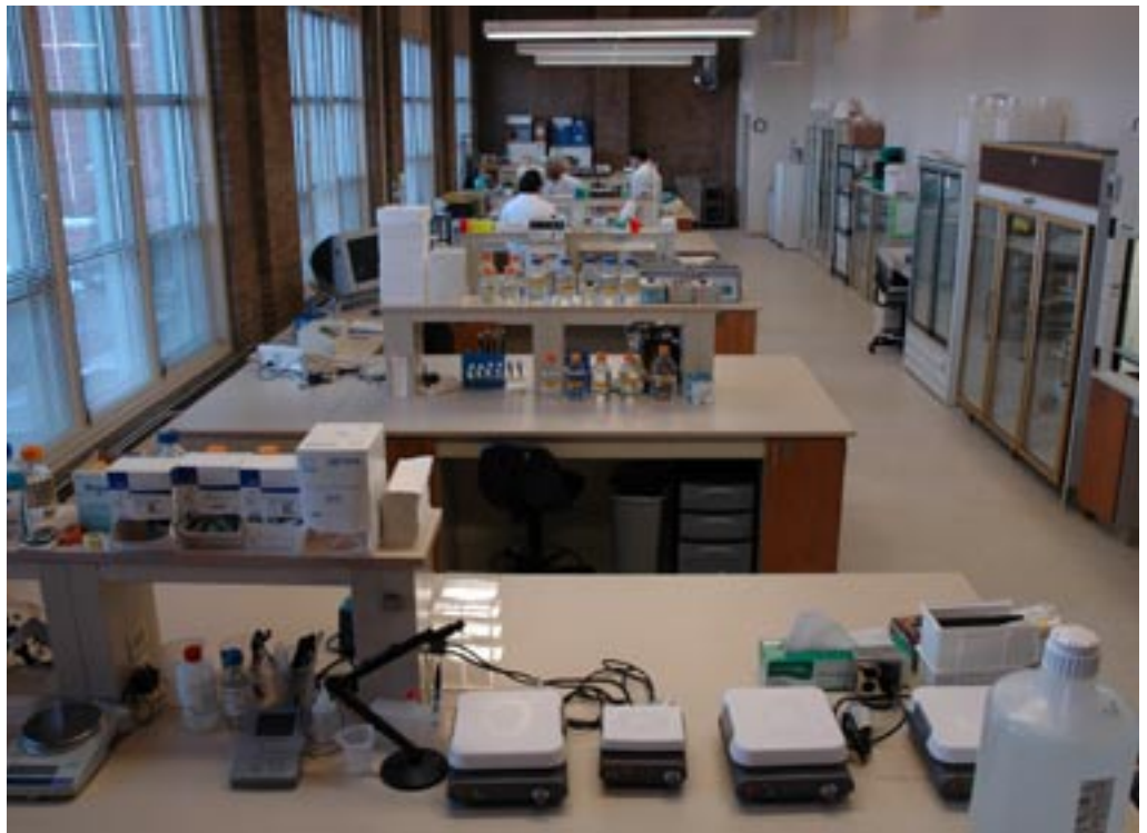
The new state-of-the art bioscience laboratories of ZyStor Therapeutics can support a large array of scientific research functions.

“The staff of the research park worked diligently to help ZyStor Therapeutics smoothly and efficiently move its offices and laboratories from St. Louis to the metropolitan Milwaukee area. The facilities are first rate.”